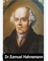
Dr. Samuel Hahnemann

Email: dkmmhmc1989@gmail.com. Web: http://www.dkmmhomoeocollege.com